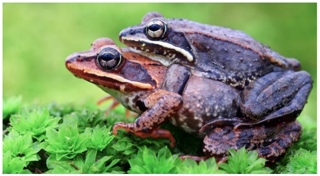
Wood Frogs