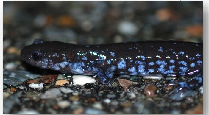
Length: 3 - 5.5"

Identification: Medium to large; brown to black with bright blue spots across body.