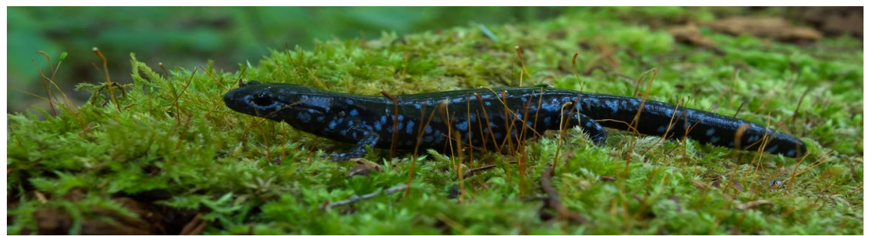
Blue-spotted Salamander © Sean Beckett